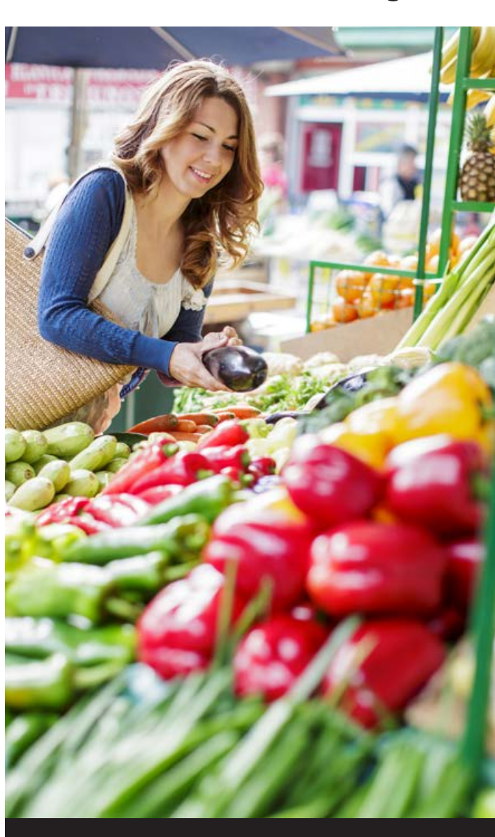
Improving nutrition & health in communities statewide